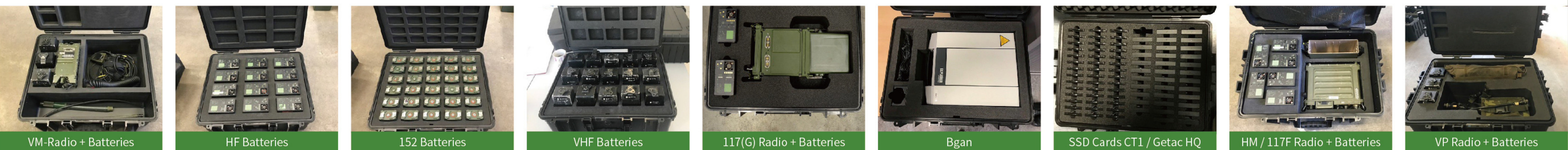
VM-Radio + Batteries