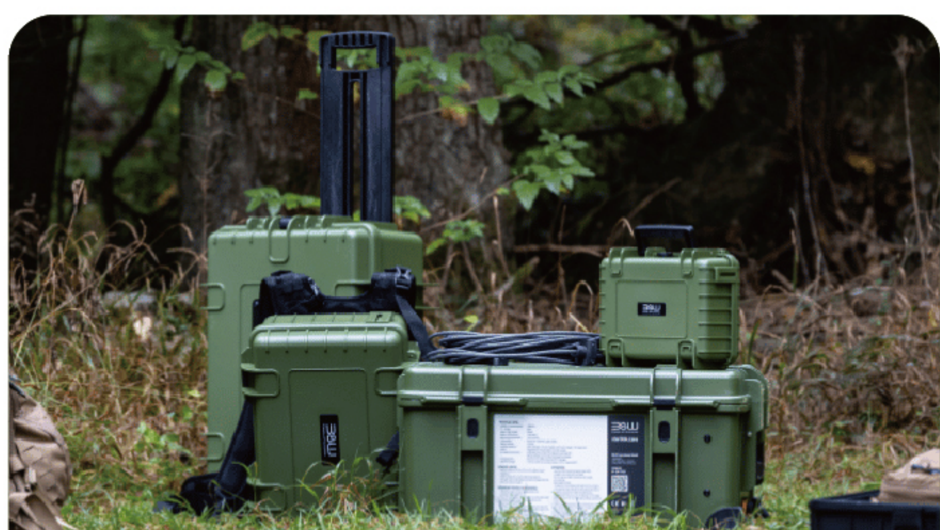
多种尺寸和颜色 Size & Colors